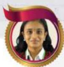
BHADRA HAREESH (MALAYALAM)