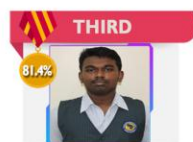
BALAJ TOPPER IN ECONOMICS